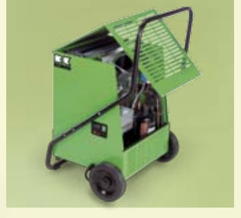
Easy service due to a easy access panels