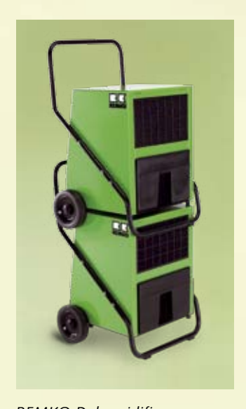
REMKO Dehumidifier are stackable

The REMKO AMT mobile dehumidifier is easy to operate and guarantees constant, malfunction-free use around the clock.