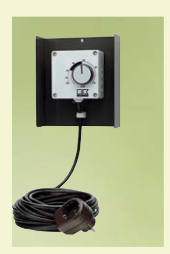
REMKO Room hygrostat, Type HR-1 , for fully automatic control, ready for plug assembly

REMKO dehumidifiers are perfectly suited for rooms in cellars, hobby rooms, conservatories, bathrooms, workrooms, recreation rooms, archives, warehouses, and so on.