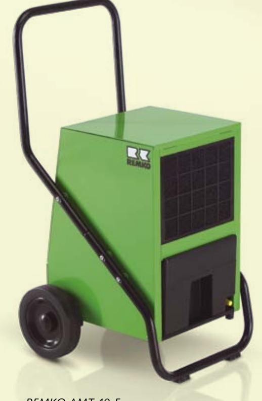
REMKO AMT 40-E